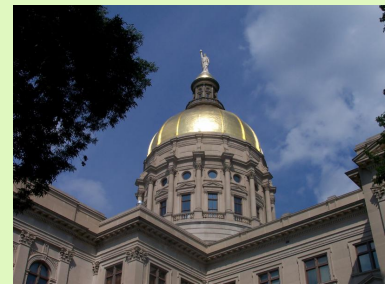
GA legislators pass few ED bills under the Gold Dome

HB 921 - required development authorities to report quarterly to their governing authorities and local school boards. It failed to pass. Meanwhile, HR 1239 created an economic development authority study committee and was approved by the House Budget & Fiscal Affairs Committee. HR1239 also died. DAFC actively worked to prevent the passage of these bills.